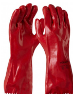
Maxisafe Red PVC Gauntlet - 35cm GPR194